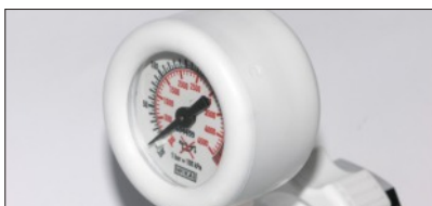
optional rubber gauge protection

reddot design award best of the best 2010