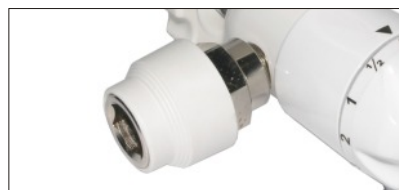
optional medical quick connector