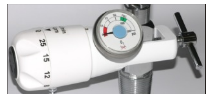
Pin Index version